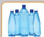
3 days supply