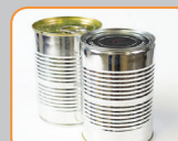
3 days supply