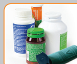
3 days supply